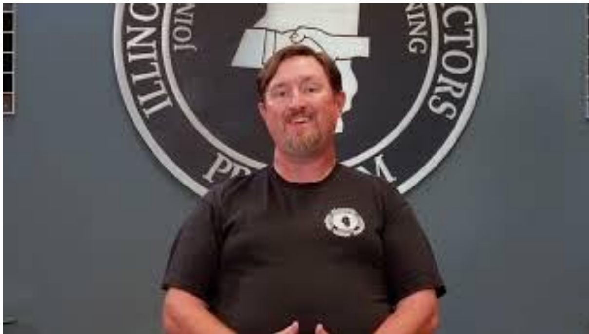
LiUNA Construction Craft Preparation Program