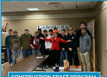
CONSTRUCTION CRAFT PROGRAM (LABORERS)