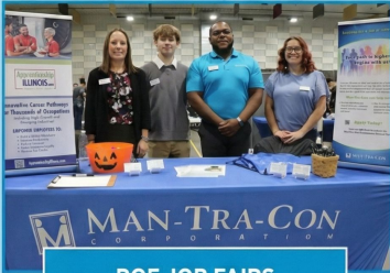
ROE JOB FAIRS