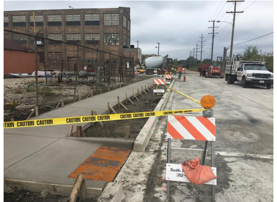
156 th Street in Harvey